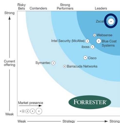
Get on board! Zscaler a leader in the Forrester Wave.

Zscaler makes the most of the benefits of being a cloud service, supporting a wide variety of devices and network environments.