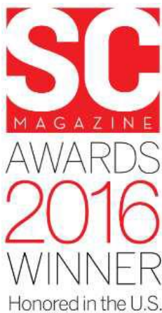
The SC Awards' Winner (2016) — Best Cloud Computing Security.