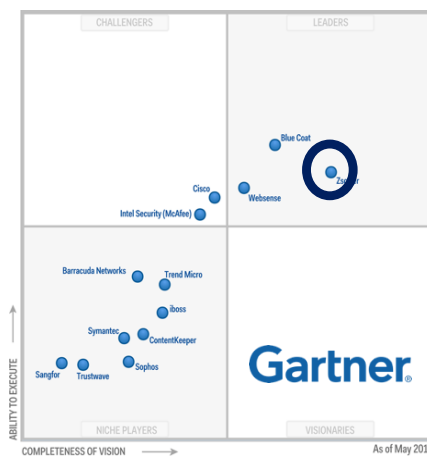
For the sixth consecutive year Zscaler is named leader in the 2016 Gartner Magic Quadrant for Secure Web Gateways.